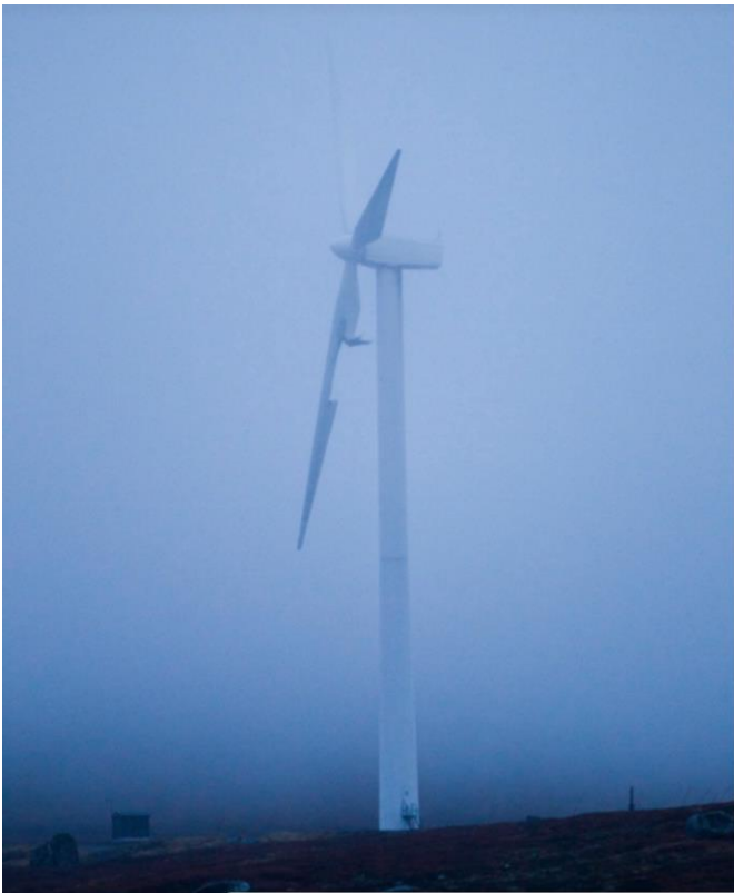
Mehuken wind power plant 2011

The next image is from the Mehuken wind power plant in Norway 2011, after the hurricane "Dagmar" with measured wind speeds upwards at 80 m/s. Large parts of the accompanied wetland environment was littered with fragments afterwards.